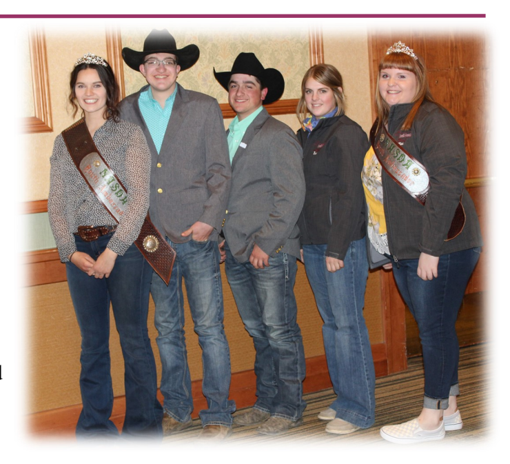
NASDJA Board of Directors and Ambassadors

A complete list of changes and updates can be found in the Junior Handbook at www.southdevon.com