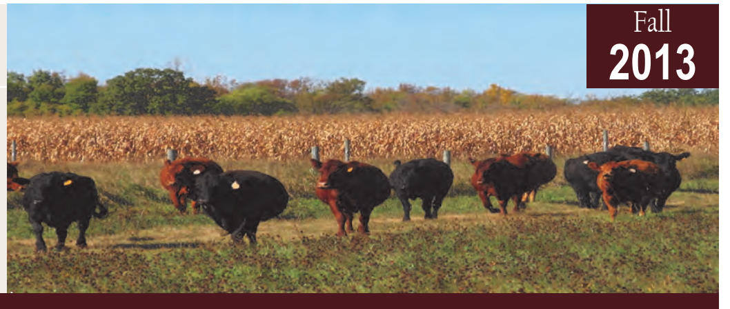
A Publication of the North American South Devon Association

2014 National Show Minnesota Beef Expo Iowa State Fair 2013 Junior Nationals 2014 World South Devon Tour