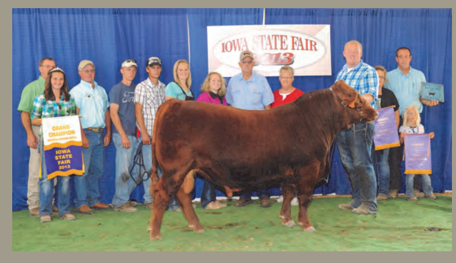
2013 Champion Bull honors went to JVM Cattle Company, Pella, IA on their entry of JVM Zeke 252Z, a May 4, 2012 son of HS E Plurbis Unum and out of Maple Leaf Iris 11N.