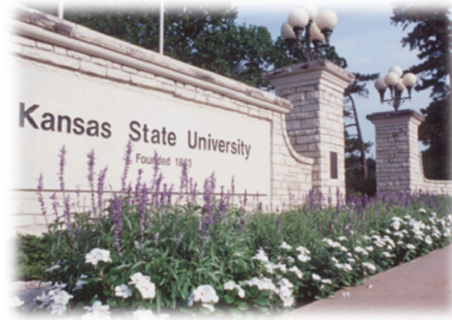
Juniors will tour Kansas State University during the 2017 NASDJA Junior National and Leadership Conference.

Home to over 100 shops and eateries, Aggieville is the main attraction within the small college town and being within walking distance from K-State makes it a must for college students and tourists, alike. The shopping district has spots that are sure to please everyone in the family. One of the highlights, Varsity Donuts offers a wide variety of early morning treats to help