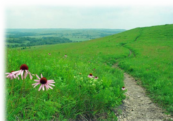
The Konza Prairie Trail just outside of Manhattan offers visitors the opportunity to see the Kansas prairie as it was hundreds of years ago, with native grasses and plants flourishing in a prairie ecosystem.

Within the small town it may be hard to see the beauty of the city, but on top of Manhattan Hill there is a birds-eye view of everything the Little Apple has to offer. Coming into town make note of the hillside inscribed with "MANHATTAN" and find time for a view at the top.