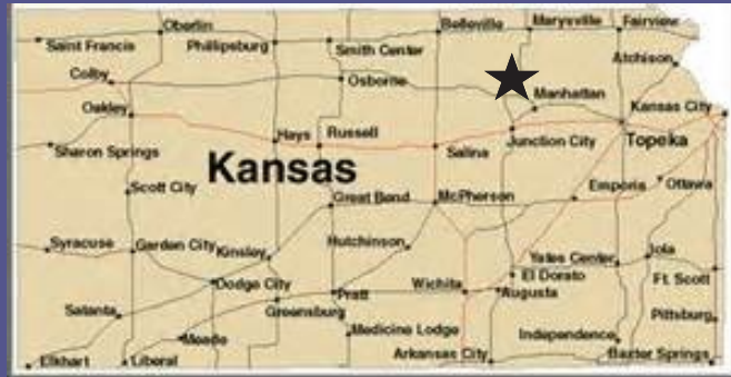
At the Intersection of Kimball & Avery Avenue Manhattan, Kansas