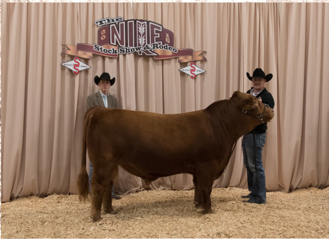
2015 Champion Bull, DLCC Two Step 84B, a May 12, 2014 son of DLCC Shur Loc 99W, owned by the Two-Step Syndicate.