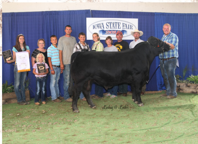
2015 Reserve Champion Bull, EVW Bobcat 465B, an April 21, 2014 son of TLC Captain Call, owned by JVM Cattle Company, Pella, IA and Hillcrest South Devon, Grinnell, IA.