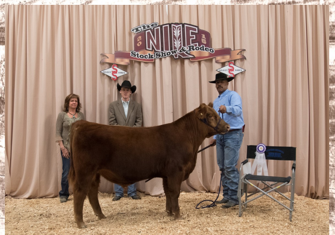
2015 Summer NILE Reserve Champion Poundmaker Bull, Haycow Bootlegger 437C, a March 20, 2015 son of DLCC Shur Loc 99W, shown by Haycow Cattle Co., Lincoln, CA.