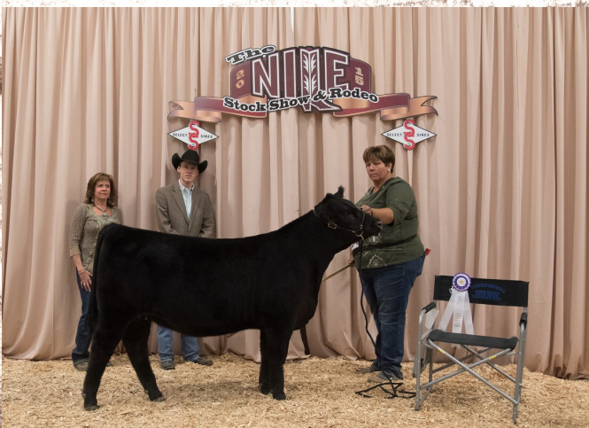
2015 NILE Champion Poundmaker Female, Haycow Tennessee Honey, a January 26, 2015 daughter of DLCC Shur Loc 99W, shown by Haycow Cattle Co., Lincoln, CA.