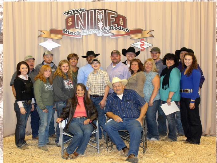
2015 NILE South Devon Show participants. Special thanks to the Western States South Devon Association for hosting the event.