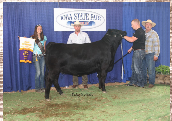
2015 Champion Female, DLCC Loop 19B, a March 21, 2014 daughter of MMM Untouchable, owned by Lane Giess, Pierz, MN.