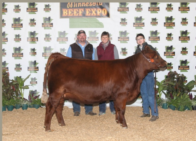
2015 Reserve Champion Female, MJB Bella 4585B, a 3/26/14 daughter of DLC The Rock 52, also shown by Kyle Stranberg, Maynard, MN.