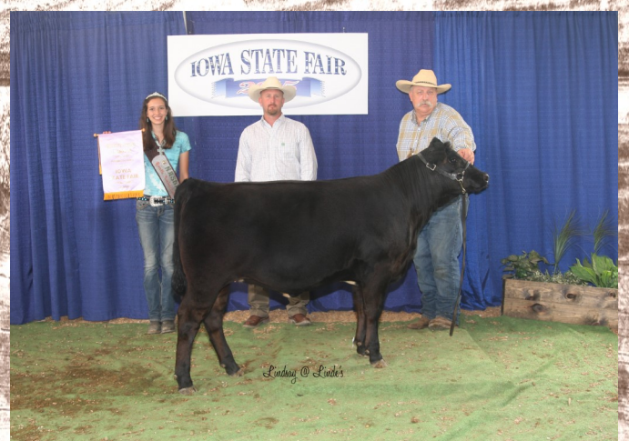
2015 Summer National Reserve Champion Poundmaker Female, DLCC Belle 115B, a December 20, 2014 daughter of DLCC Shur Loc 99W, owned by Leah Giess, Pierz, MN.