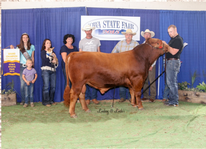
2015 Champion Bull, DLCC Two Step 84B, a May 12, 2014 son of DLCC Shur Loc 99W, owned by the Two-Step Syndicate.