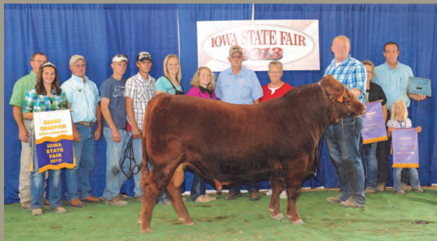
2013 Champion Bull honors went to JVM Cattle Company, Pella, IA on their entry of JVM Zeke 252Z, a May 4, 2012 son of HS E Plurbis Unum and out of Maple Leaf Iris 11N.